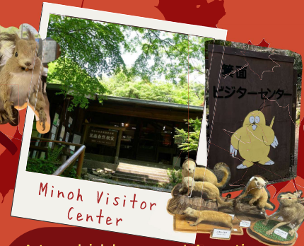
Minoh Visitor Center

One of Minoh's most famous spots, and for good reason! It's beautiful at any season and hosts many events.