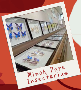
Minoh Park Insectarium

A beautiful pond surrounded by local nature, perfect for resting!